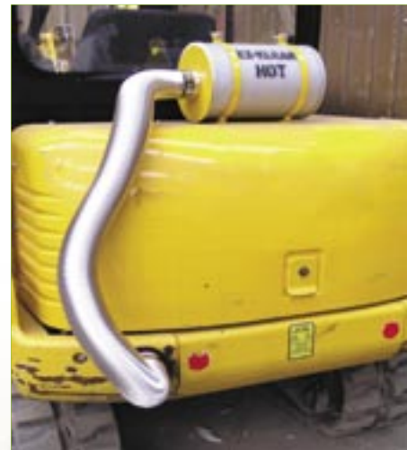
(Temp Trap fitted to a mini excavator working indoors)

* Temp Trap allows up to 90% reduction in PM 10